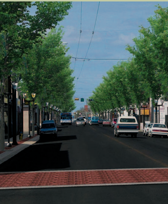
Planned Streetscape Revitalization