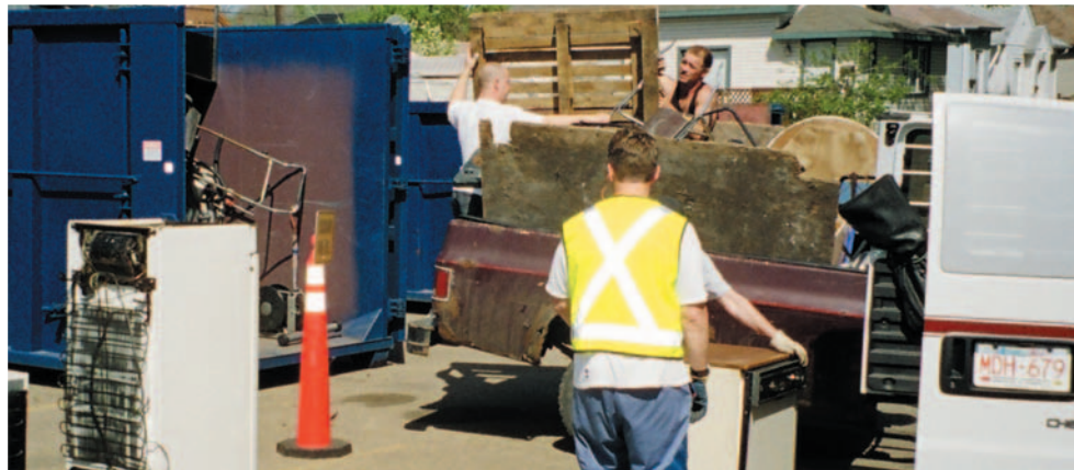
Volunteers at the Large Item Clean Up day, 2006

Members from the Safe Streets Working Group have created a pilot project called "Operation Clean Sweep" to strategically address crime and safety in the area. Teams will work with residents, businesses, Edmonton Police and Bylaw to build relationships, identify problems and seek solutions. Operation Clean Sweep, in three stages, will systematically work in 2 block sections. The first stage (SWEEP) will assess and identify issues and problems. The second stage (SECURE) will build relationships, encourage community involvement and work to eliminate problems that are identified. The third stage (REBUILD) will monitor problems and work on beautification of the area. Community involvement is VITAL for this initiative to be successful. If you would like to be involved in "Operation Clean Sweep" please call Judy Allan at 496-1913.