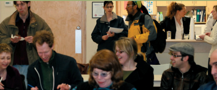
Meeting with visual, performing and theatre artists to discuss the year ahead

Arts on the Ave is an active, creative body of artists that are passionate about bringing the energy back to the avenue.